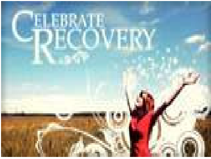
Celebrate Recovery A Christian 12-Step Program Friday's at 1:00PM Call (812) 401-4440