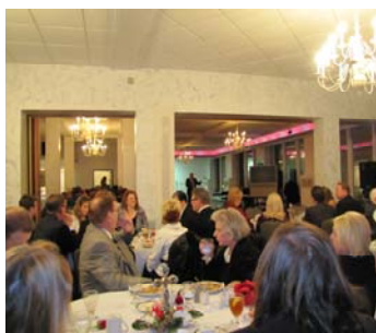
Valentine's Day fundraiser

Information Watch Be on the Watch for Info on Vacation Bible School and Summer Camp Coming Soon!