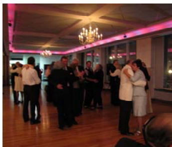
Those who attended the Valentine's Day fundraiser on the dance floor

Vendors, call (812) 459-6721 to inquire about booth space